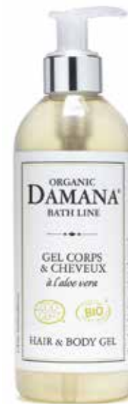
HAIR & BODY GEL