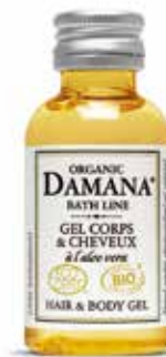
HAIR & BODY GEL